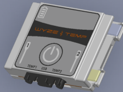
PELLET GRILL RETRO-FIT KIT

To schedule a demo or for questions and service, please contact us: